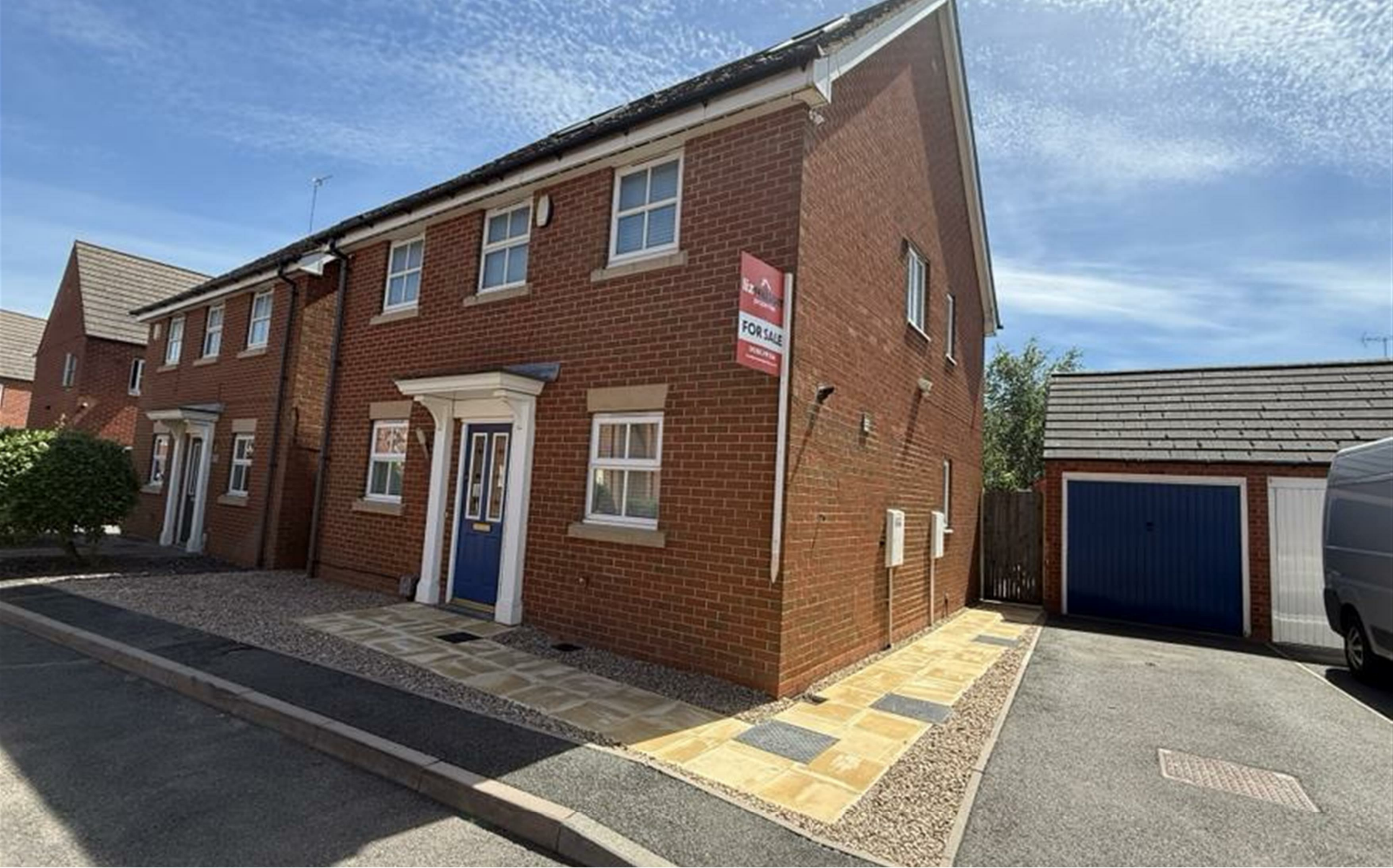
9 Victoria Drive Swadlincote, DE11 8DY Reduced to £299,950