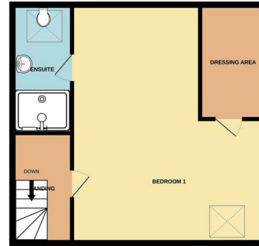
2ND FLOOR 531 sq.ft. (49.4 sq.m.) approx.